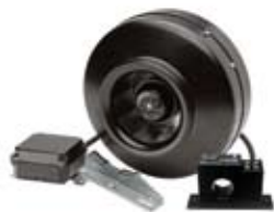
Fan with Current Sensor