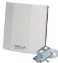
Sidewall Fan with Unattached Pressure Switch