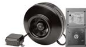
Fan with Interlock